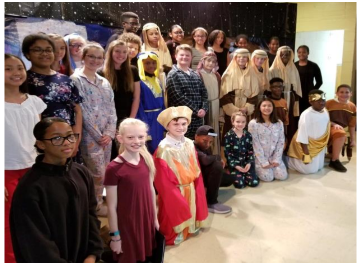
Christmas Program cast and crew after the show