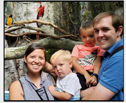
Pausing for a family photo in the Rainforest Exhibit at the National Aquarium in Baltimore

** (All Spanish words can be found in the “Vocabulario” box at the bottom of this webpage!)