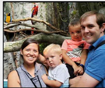
Pausing for a family photo in the Rainforest Exhibit at the National Aquarium in Baltimore

I have a B.A. in Spanish Literature and a Business Administration minor from Chestnut Hill College, a small Catholic school just outside of Philadelphia. I have played piano for 25 years, and also play the flute, oboe, saxophone, euphonium, guitar (although barely), and any instruments I can get my hands on. (Mastering the violin is my most recent quest.) Some of my other hobbies include napping, singing, reading, painting, watching movies, playing games, and just relaxing with my esposo , our hijos , and our perro .