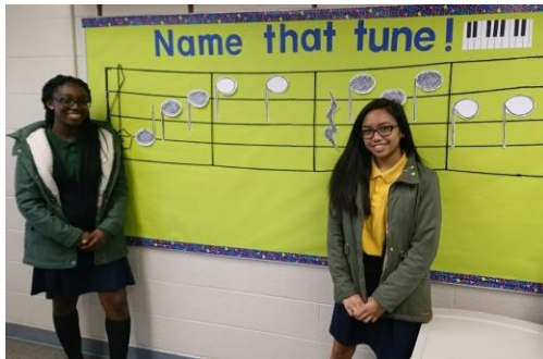
Winners of my "Name that tune" board this quarter

We have had an awesome year in music class so far, specifically with regards to our choral achievements! During a field trip to historic St. Mary's City, the 3rd, 4th, and 5th grades made me proud with their beautiful a capella rendition of "Hail, Holy Queen" in the Brick chapel. The group received many compliments. We are also excited for an upcoming St. Peter's Spirit Night/Blue Ribbon celebration during which one of our 8th graders will sing the National Anthem at the start of a Blue Crabs baseball game! During the 7th inning stretch, some of our students will also be singing "America, the Beautiful" on the field. Go Storm!